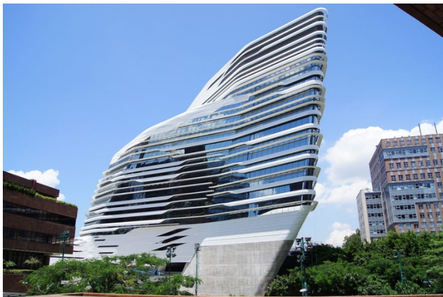
Figure 4: Jockey Club Innovation Tower by Zaha Hadid (2013), Hong Kong

To create a clear distinction between the futurist architecture of 1910-1920 and the architecture of post 1950s, futurism was renamed as 'Neo-futurism' by French Architect Denis Laming, who designed Futuroscope (a theme park rich in multimedia, cinematography & audio-visuals) [23]. Neo-futurism is also called Post Modern Futurism or Neo-Futuristic architecture. Neo-futurism speaks of all of futurist architecture built since late 1960s. It has a long list of Architects who practiced it and the impact is a worldwide phenomenon from Eero Saarinen's TWA Terminal at New York's J.F.K. Airport to Museum of Tomorrow in Rio de Janeiro by Santiago Calatrava [18][19]. Some of the most prominent pioneer Architects of Neo-futurism are Eero Saarinen, Alvar Alto, Buckminster Fuller, Le Corbusier, Santiago Calatrava, Michael Graves, Zaha Hadid, Oscar Neimeyer and Tadao Ando [20][21].