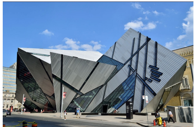
Figure 4: Royal Ontario Museum by Daniel Libeskind (2007), Hong Kong

Deconstructivism originated in 1982 through a competition entry by Jacques Derrida and Peter Eisenman, the competition was however won by Bernard Tschumi [26]. Neo-futurism and Deconstructivism are linked with each other in such a way that it becomes difficult to determine where to draw the line of their differential aspects. Deconstructivism relies on Computer aided design (CAD) to visualize various forms and tendencies of the material and design elements. It opposes the established periphery of modernism and post-modernism in terms of rationality.